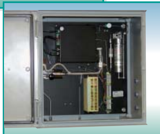
Model 3050-OLV in a black box configuration, top NEC Class I, Division 1/CENELEC Zone 1 explosion-proof enclosure, center NEMA 4X weather-proof enclosure, bottom